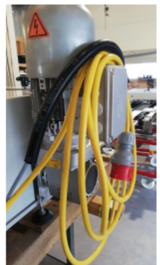
Motor with 2m cable