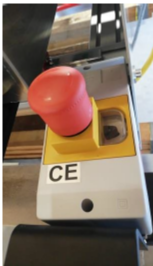
On/off switch and emergency stop (removable)