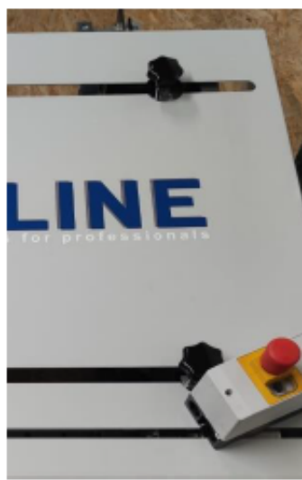
Width adjustment via Quickstep