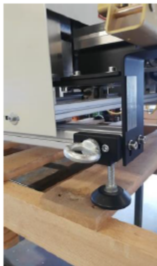
Crane eye and adjustable foot